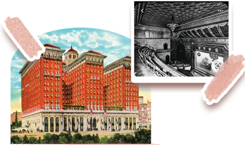
The Biltmore Auditorium

hairn't his gingHAM tacky button Kentucky Grammar