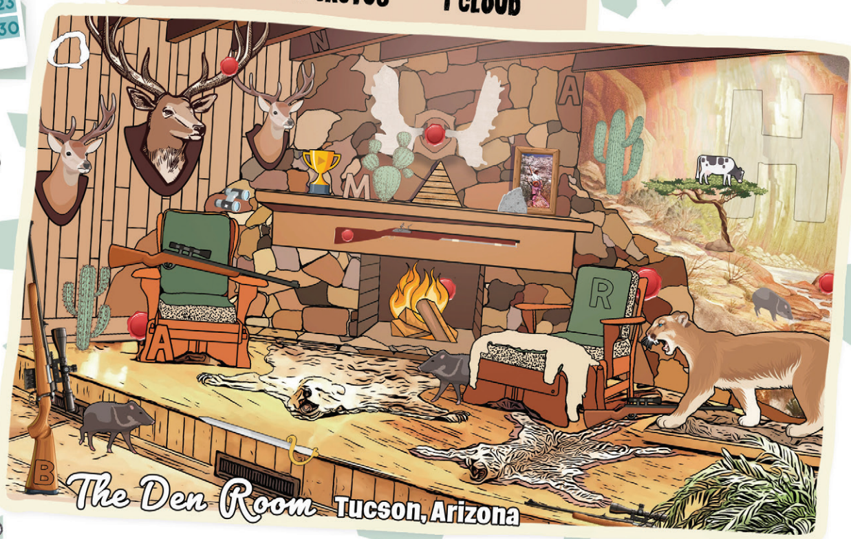
The Den Room Tucson, Arizona