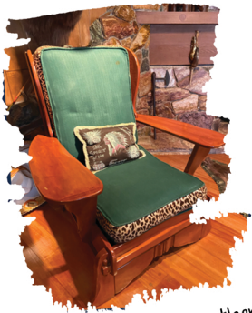
One of the chairs Brother Branham was sitting in as the Seven Seals were revealed to him!