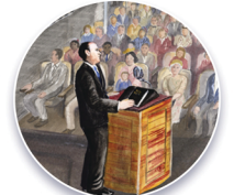
MARCH 17-24, 1963 REVEALS THE SEVEN SEALS Because, you'll get it on the tape, because they've been playing them tapes back, and they're really good and plain. So, you'll get it clearer there.