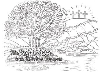
use this page to trace on your canvas