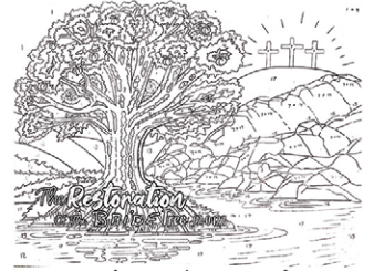
numbered page for painting reference